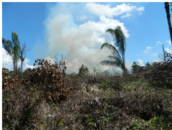
Photos 24 and 25: Deforestation Observed along the Road to the Mapiá River 24 th June 2013

A majority of deforestation instances observed within the project area during monitoring activities since the start date of the project have comprised of only historical small scale deforestation (2-4 hectares) and are mainly relating to cattle-farming and burning. This observation data was gathered to assist in compiling complete project area records and to contribute towards the selection of areas to be chosen for medium to high resolution remote sensing analysis when appropriate. Although exact co-ordinates have not been gathered for these observation instances, the reference points for the locations within the records are meaningful to the inhabitants of the project area who carried out the observations, and are therefore able to be located again easily using their local knowledge, when exact georeferencing co-ordinates can be gathered as required.