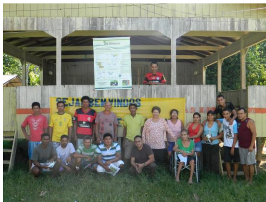
Photo 21: Follow-up meeting with São Joaquim community, 13 th July 2013