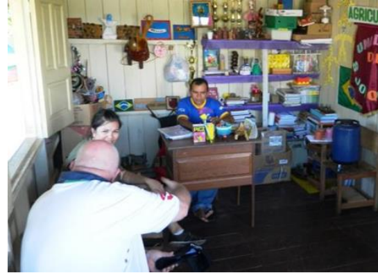
Photo 19: Visit to the Maria Borges School, in São Joaquim, 25 th June 2013