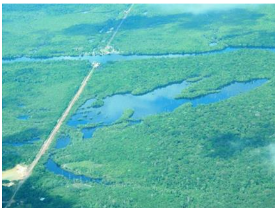
Photo 8: BR-319 on the West border of the project area; 26 th June