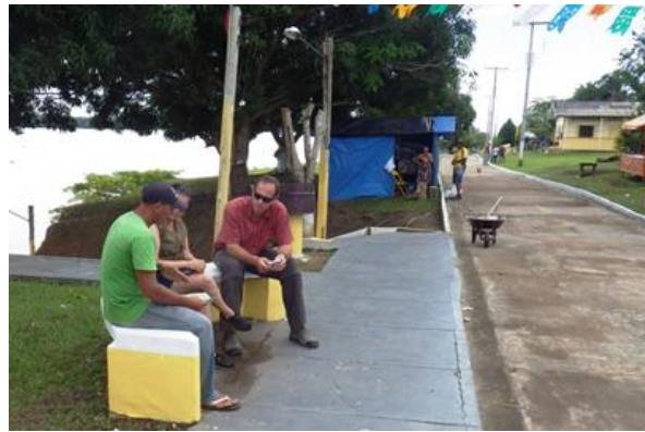
Photo 16: Discussion with the Community Leader of Caiçara, 25 th June 2013