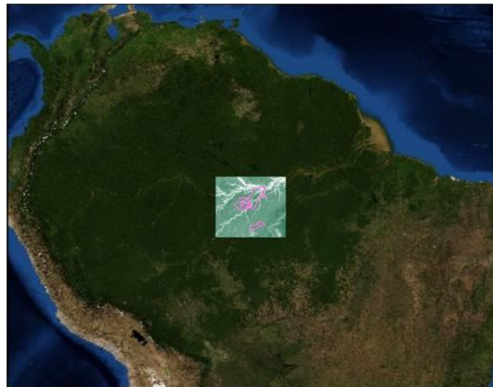
Map 1: Showing the Extent of the Adjusted Carbon Layer in the Geospatial Platform

The extent to which the carbon layer within the Geospatial Platform has been adjusted is illustrated below: