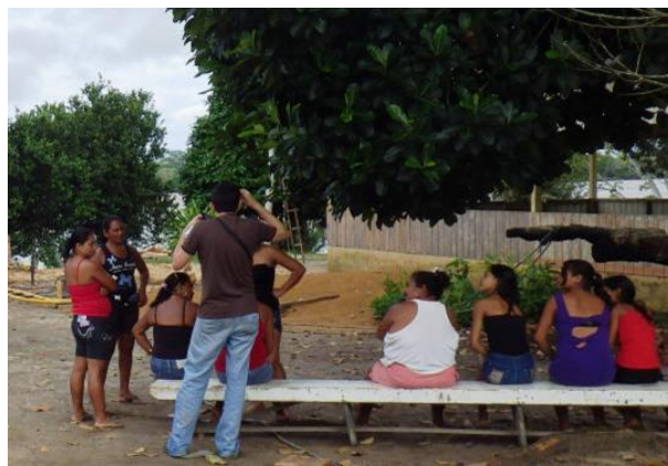
Photo 17: Members from the Castanhal community participating in the discussions, 25 th June 2013

In the afternoon, the group visited communities along the Upper Madeira River, which included Jauari, Santa Helene, Awará, Ponta Alegre and São Joaquim. During these visits, the community representatives had the opportunity to enquire with the project team about the next developments planned for the project and also raise concerns and ideas with the PIT. One of the main concerns raised from communities in both the Upper and Lower Madeira River areas was finding sustainable ways to produce their food and the products that they sell to generate their income. In general it was found that people are keen to use sustainable alternatives wherever possible and learn new techniques in order to reduce deforestation.