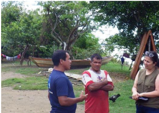
Photo 15: Conversation with the Health Agent and Community Leader of São José, 25 th June 2013