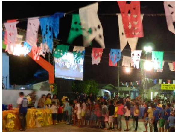
Photo 5: Saint Joseph Party in Axinim Community, during which a video about the project was displayed

24 th June 2013 – Meeting held at the City Council in Borba with approximately 30 people attending, including members of CGV and IAL, for a round of questions submitted by the verifier for the verification of the project. The Mayor of Borba, Baía, was representing the Municipality, together with all the Municipal Secretaries, and all 9 members of the city council. There were also people representing the indigenous communities, the Rural Producers Union and the local office of IDAM. The members of the Municipality were questioned about their understanding of the project, its activities and the duties of the Municipality. The project team also had the opportunity to answer questions from the Municipality and update its members on recent developments of the project.