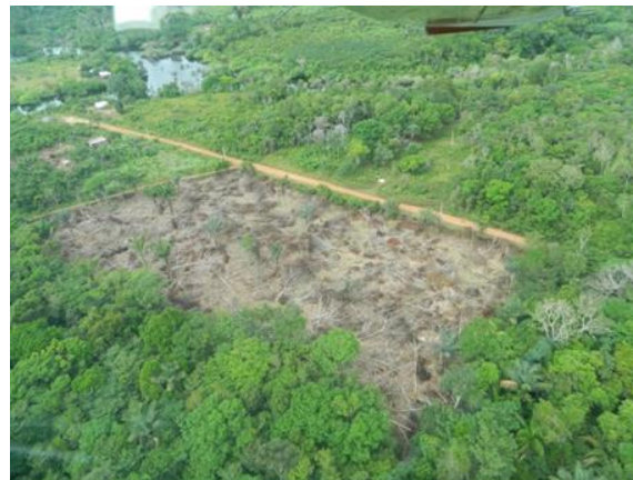
Photos 26, 27 and 28: Historical Deforestation Observed in the Central Zone and along the Road to the Mapiá River Date: 26 th June 2013

A sample summary of aerial observations can be seen in the table below: