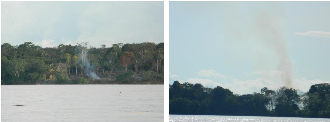
Photos 22 and 23: Examples of fires observed on the Upper Madeira River 25th June 2013

Some example observations of occurrences of deforestation are shown as follows: