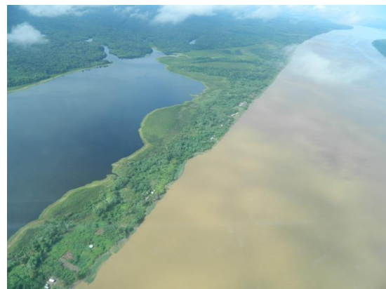
Photo 9: Above part of the Central Zone of the project, where communities such as Awará and Awarizinho are located; 26 th June