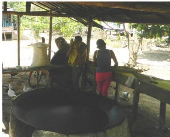
Photo 13: Family from Assentamento do Incra shows the project team how they produce cassava flour, 24 th June 2013