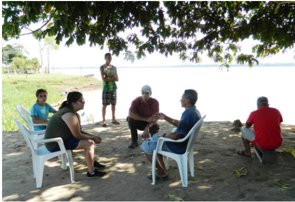
Photo 18: Meeting with the members of Ponta Alegre, during which the members spoke about their willingness to find sustainable alternatives for agriculture, 25 th June 2013