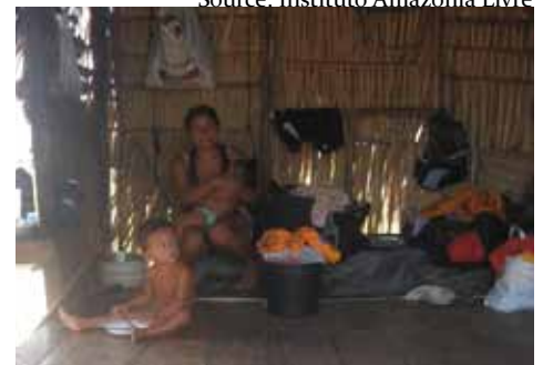
A family from the Autazes region, in the Madeirinhas project area

Celestial Green Ventures has signed a mutually beneficial 30-year agreement with the Municipality of Autazes, showing a long-term commitment to the project area, the municipality and its inhabitants. CGV is now working with the community to improve livelihoods of the local people.