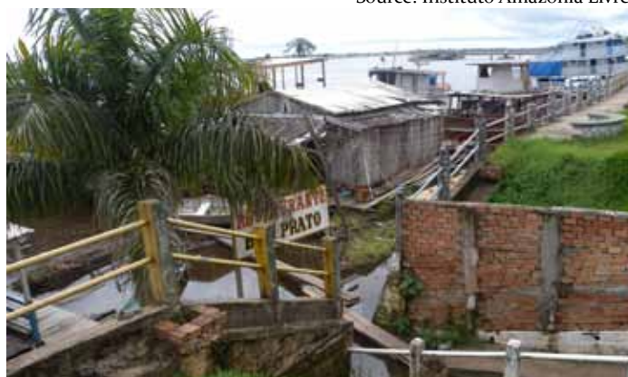
Houses in the municipality of Autazes

The lack of quality infrastructure, jobs, education levels combined with issues surrounding water supply and waste treatment all contribute to a difficult environment in which to prosper. CGV in